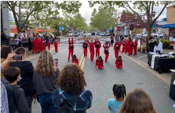
Love2Dance performs for a crowd at 1 st Fridays