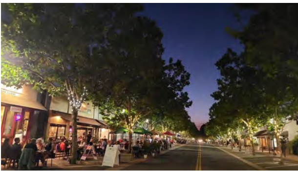
Diners enjoy the many wonderful restaurants along Grant Avenue.