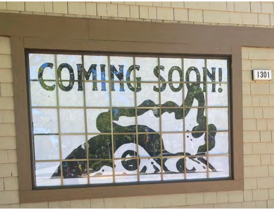
HenHouse will open a taproom at 1301 Grant Ave. and the community enjoys Rock the Block in June.

This year continued to see signs of growth and resilience. Many businesses began to thrive again and our citizens came out in full force – supporting our continued efforts to create a beautiful and vibrant Downtown. We have our eyes focused squarely on the future. We saw some new doors open and exciting projects emerge. Wicked Slush has created a perfect spot for teens and families; HenHouse finalized their taproom plans and are just about to start construction; Wild Fennel & TOPO Chiropractic will open their doors in October; and the Historic Train Depot plan has begun to take shape.... just to name a few. The strength and resilience of our 417 business owners should leave us all feeling #NovatoProud.