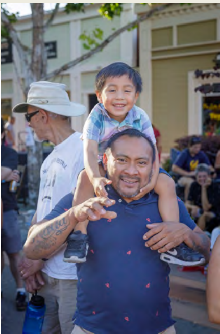
New traditions like Princess Story Time at Village Child during First Fridays on Grant were created and beloved events like Rock the Block were back in full force bringing the community to Downtown.