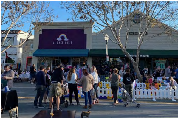
Families gather as their children play.